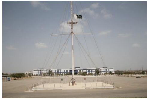
Parade Ground/ Cadets' Block