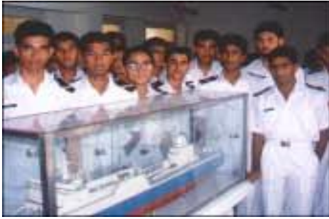
Ship Model Room