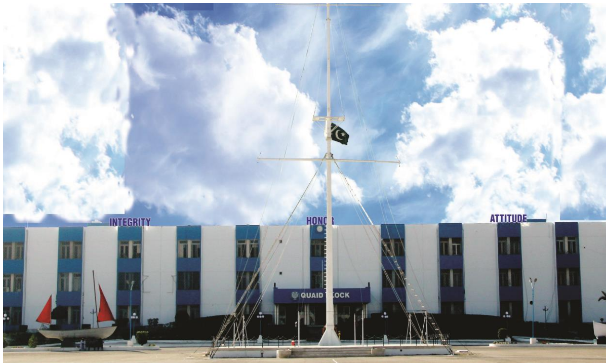
A View of Admin Block

PMA is the only Public institute of Pakistan for training of Seafarers, for pre and post sea courses. It is affiliated with NED University of Engineering & Technology, Karachi, which awards Associate Degree in Nautical Science and Marine Engineering to Cadets on completion of 02 years pre-sea training.