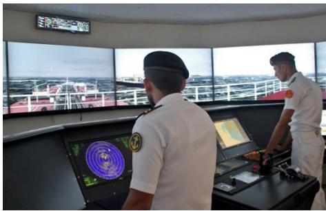
Full Mission Bridge Simulator

Experienced and dedicated teaching faculty members cater for the educational and training needs of the students. The basic training is offered on full residential basis, while pre-sea and post-sea short courses are offered for day scholars.